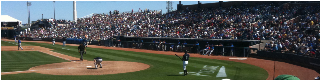
Figure 1: This is a teaser

The Kumquat Consortium jpkumquat@consortium.net