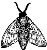
Figure 3: A sample black and white graphic that has been resized with the includegraphics command.

It is strongly recommended to use the package booktabs [15] and follow its main principles of typography with respect to tables: